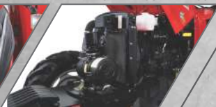
POWERFUL E3 ENGINE WITH UNDERHOOD EXHAUST