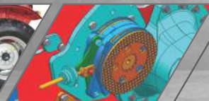
SUPER STRONG OIL IMMERSED BRAKES