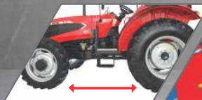
LONGER WHEEL BASE & HEAVY WEIGHT TRACTOR FOR BETTER STABILITY