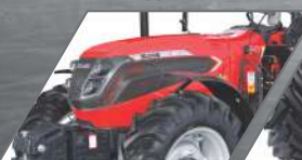
SPECIAL APPLICATIONS COMPATIBILITY