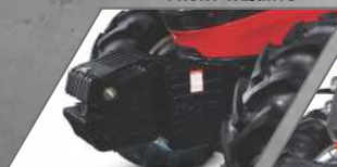
FACTORY FITTED FRONT WEIGHTS