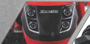
STYLISH TWIN PROJECTOR WITH LED DRLs