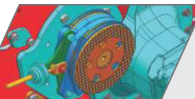
WET DISC BRAKES