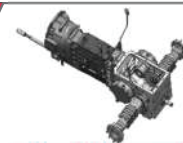
NEXT GENERATION TRANSMISSION